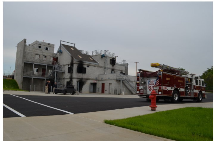
Rear of Burn Building

For more information, or to request space for your next training, please visit the “Public Safety Training Campus” page on the DES website at www.chesco.org/des .