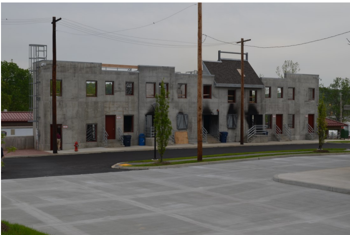
Front of Burn Building