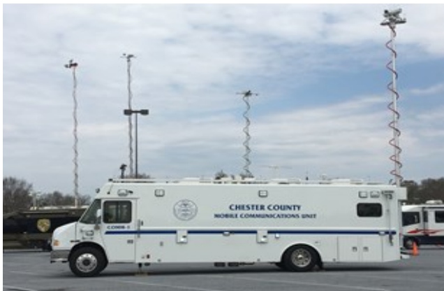
Above – Chester County COMM1 set up and operational at the 2016 Pennsylvania Command and Communications Rally in Hershey, PA.

In addition to participating in the “roll calls”, the staff from Chester County was able to leverage remote Internet Protocol connections with CAD and the radio system to “take control” and effectively dispatch Police/Fire/EMS agencies from their position in Hershey. The Harris V IP Software allowed full radio console functionality outside of the traditional RF coverage footprint of the P25 Network. This entire “remote dispatch” function was performed without any visible effect to the field users.