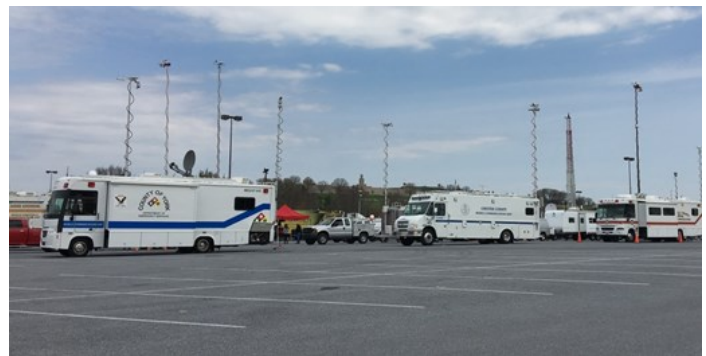
Above – Various Mobile Communications Vehicles from the region on display at the Rally, Chester County COMM 1 is pictured (second from the left)

These exercises demonstrated the abilities of the various communications units to unite on common channels and communicate together, as would occur in a disaster or emergency scenario where distant mutual aid would be requested.