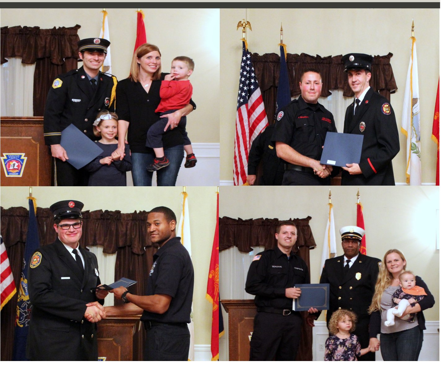
Graduation pictures are available on DES Social Media