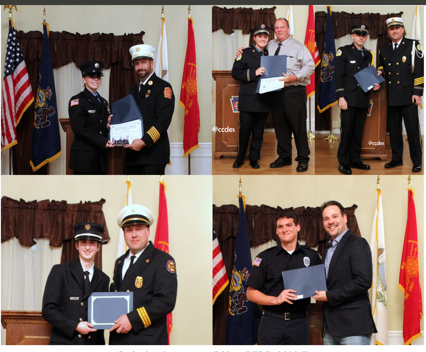
Graduation pictures are available on DES Social Media