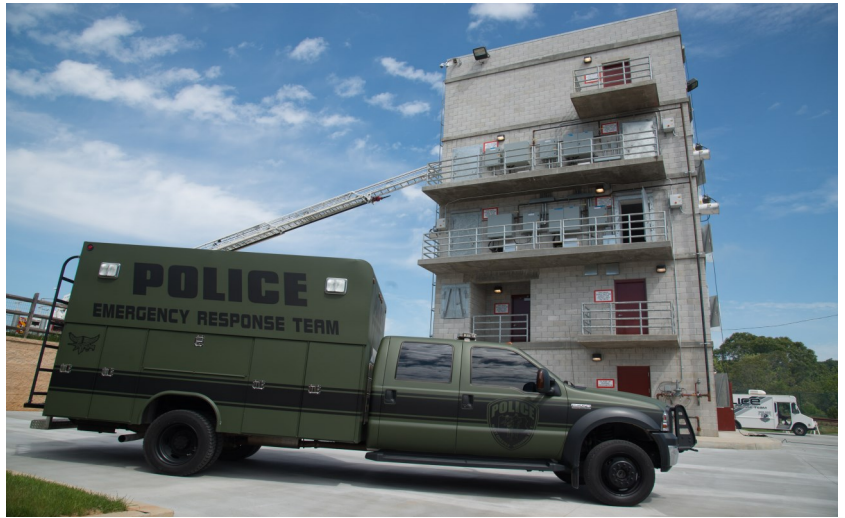
Pictured left and top right are images from the SWAT demo during the official opening of the Tactical Village on May 15, 2015.