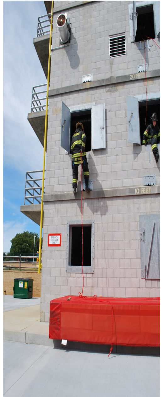
Pictured bottom left and bottom right are Images from the Radnor Fire Company which took place on Sunday, August 23, 2015.