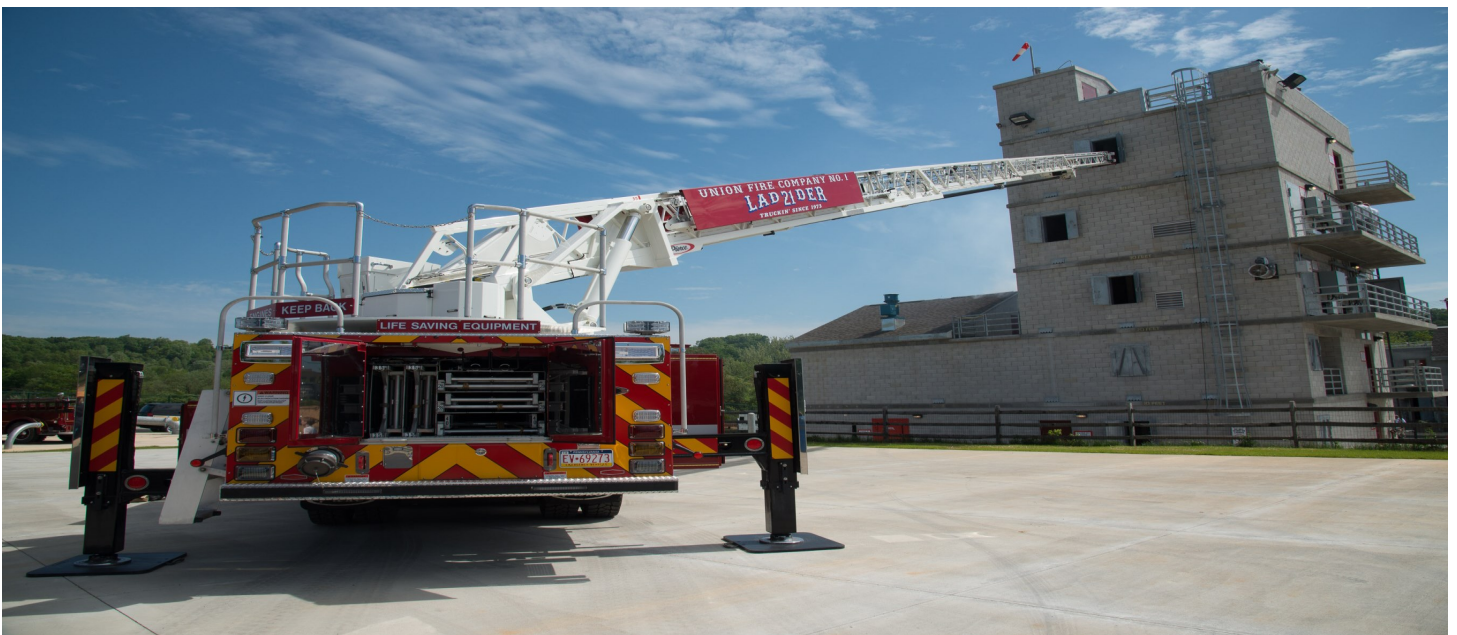
Pictured Above: Front View of Drill Tower/Scenario Building

For more information, or to request space for your next training, please visit the “Public Safety Training Campus” page on the DES website at www.chesco.org/des .