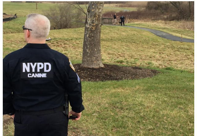
Pictured Above: NYPD Canine Officer at the Public Safety Training Campus.